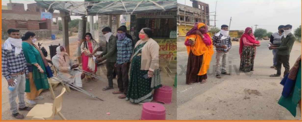
राजकीय महाविद्यालय मालपुरा के विद्यार्थियों ने अजमेर रोड व जेल रोड पर मास्क व सेनेटाइजर वितरित किए ।